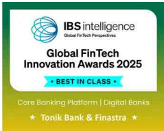
IBSi Global FinTech Innovation Awards (2025) Best-in-Class Core Banking Platform Digital-Only Banks with Tonik Bank