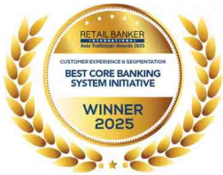
Retail Banker International Asia Trailblazer Awards: Customer Experience and Segmentation (2025) Best Core Banking System Initiative