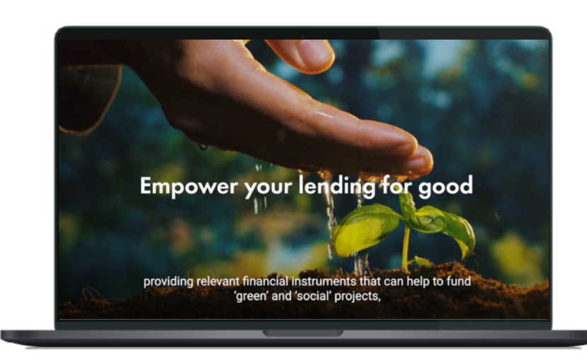
The future of lending is environmentally sustainable

Highly flexible and comprehensive, the ESG service can seamlessly manage heterogenous deal terms and ESG KPI's using an open design that fosters adaptability for new functionality and collaboration with partners.