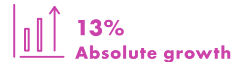
Asset Manager Record Profitability in 2017