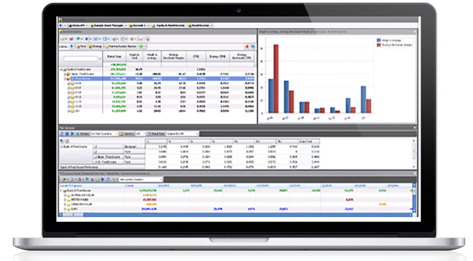
Portfolio manager dashboard

By representing every event as a singularity in a database, Fusion Invest maintains data consistency throughout the organization without duplicate data sets. This ensures that the portfolio manager, risk manager, and performance analyst use the same prices, analytics, and classifications.