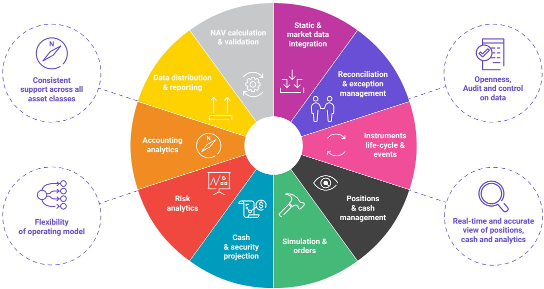
Collaborative and future proof solution

This allows an organization to expand its range of products and services without increasing operational overhead. As Investment Managers look for more agility and cost optimization, Fusion Invest can be deployed on private and public clouds.