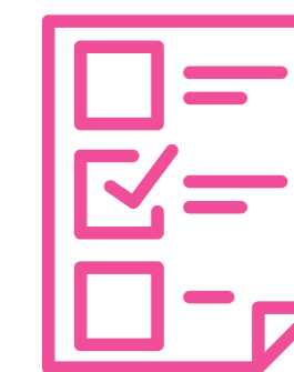
Enact laser-focused analytics