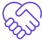
Best practices implementation

Infrequent, large, disruptive, and risky upgrades